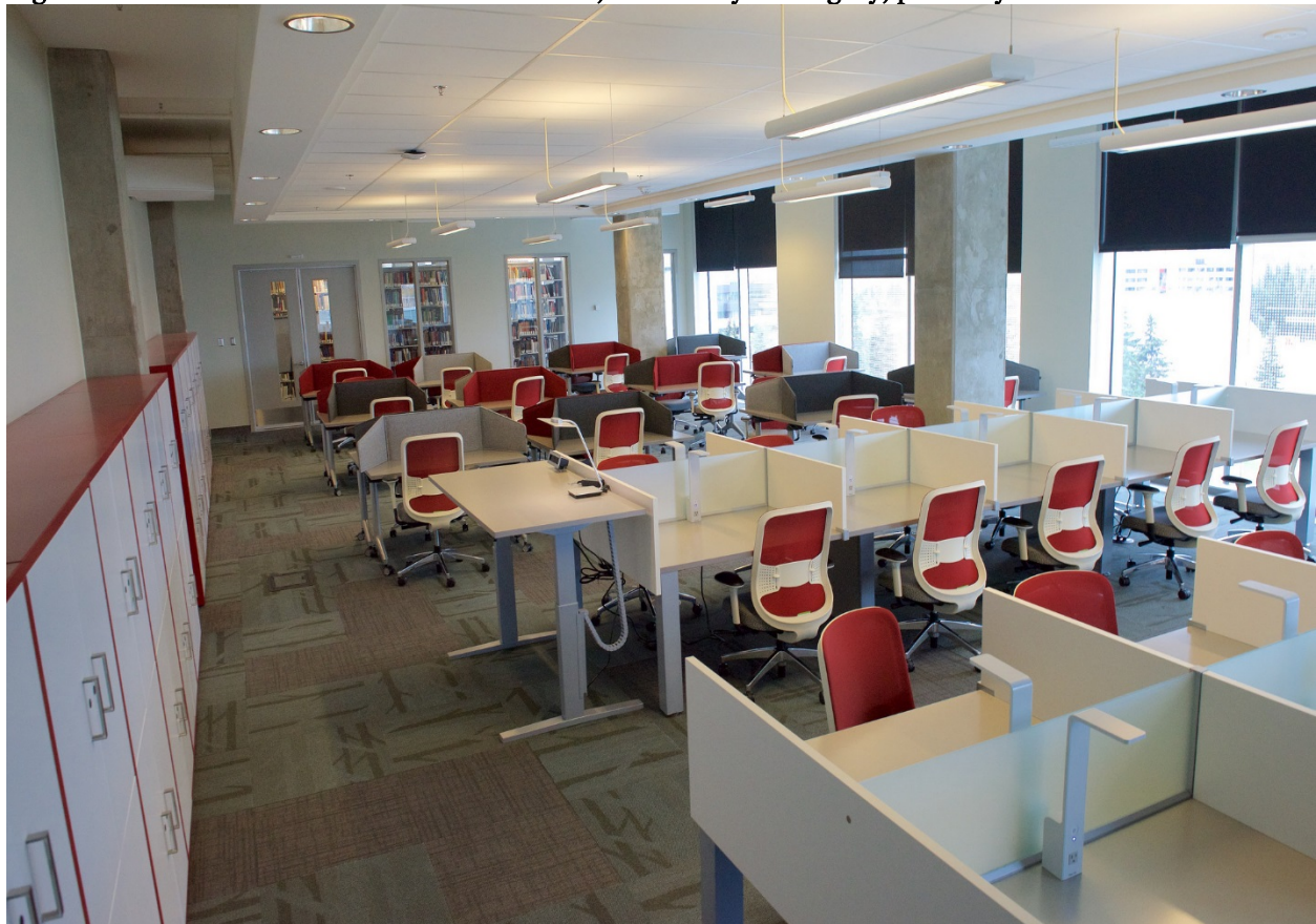
Figure 1: Alan MacDonald Graduate Commons, University of Calgary

Figure 1 above shows the Commons with the windows to the right and lockers to the left. Carrels (in the forefront of the photo) are at the back of the room, and moveable tables with optional dividers in place are towards the front of the room. The door has swipe card access. Chairs are adjustable. This is a photo of the room without students.