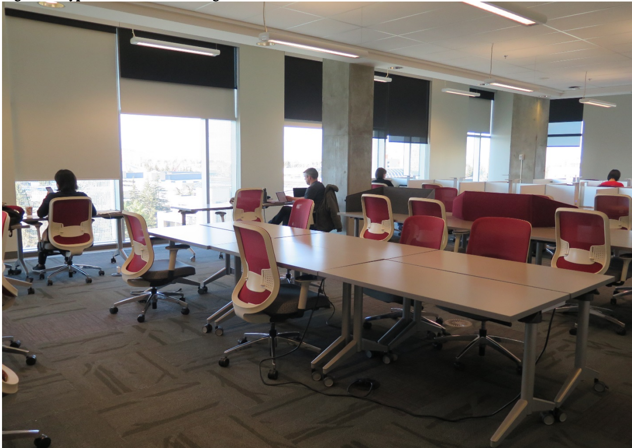
Figure 2: Typical Commons Seating Distribution Preference

Figure 2 above shows students distributed in the Commons with 4 students in the room. Two students are each sitting alone at a table quite removed from each other, at the window and facing outwards. The third and fourth students are seated at carrels far from each other and both facing away either at the window or away from the door, facing the wall. They each have a defined space and also demonstrate a preference to work away from each other.