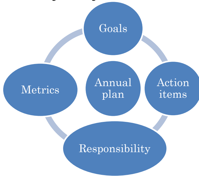
Figure 1 University Libraries Strategic Planning Process