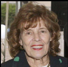
Sue Paterno Library Development Board