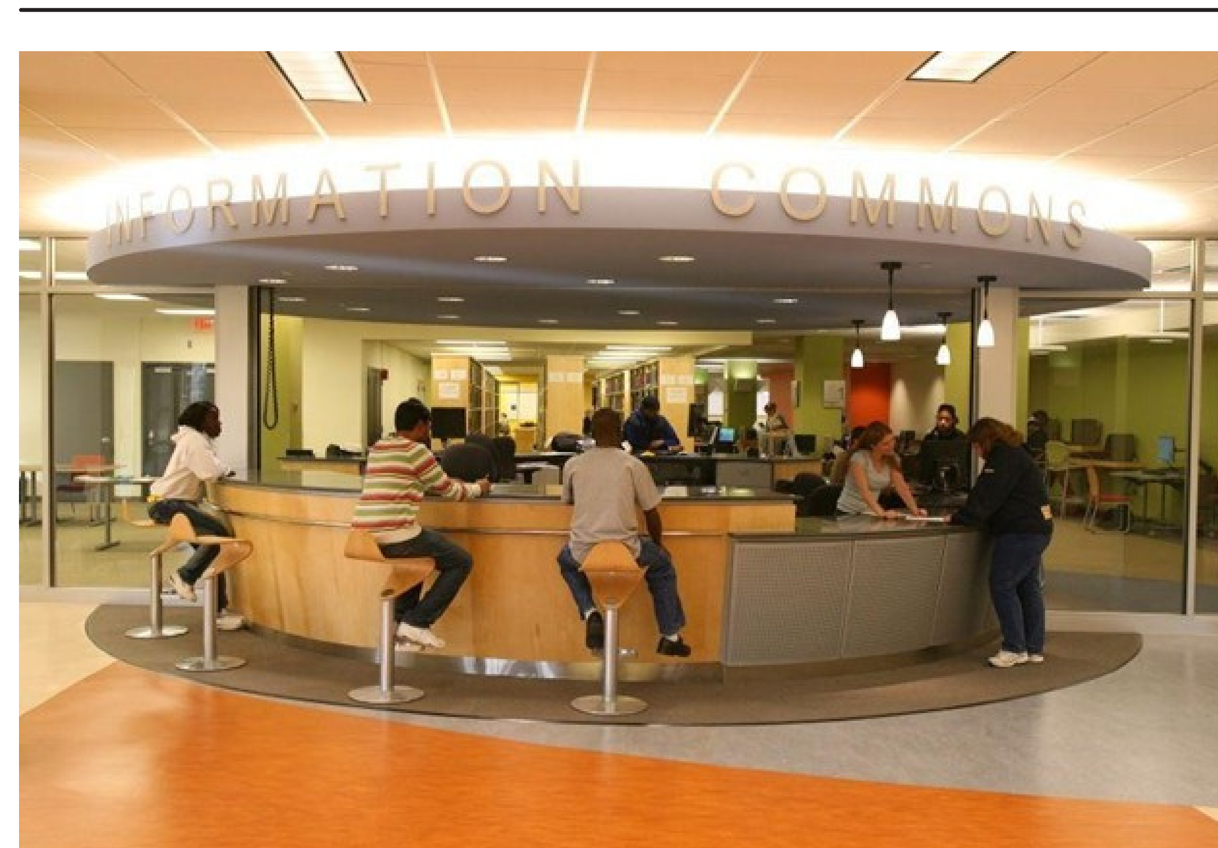
Sample image from student survey. Respondents were asked to comment on what they liked or disliked about the furniture in the image.

Internal (UL employees) and external (students, faculty, and staff) stakeholders were asked to contribute to the revisioning of the building.