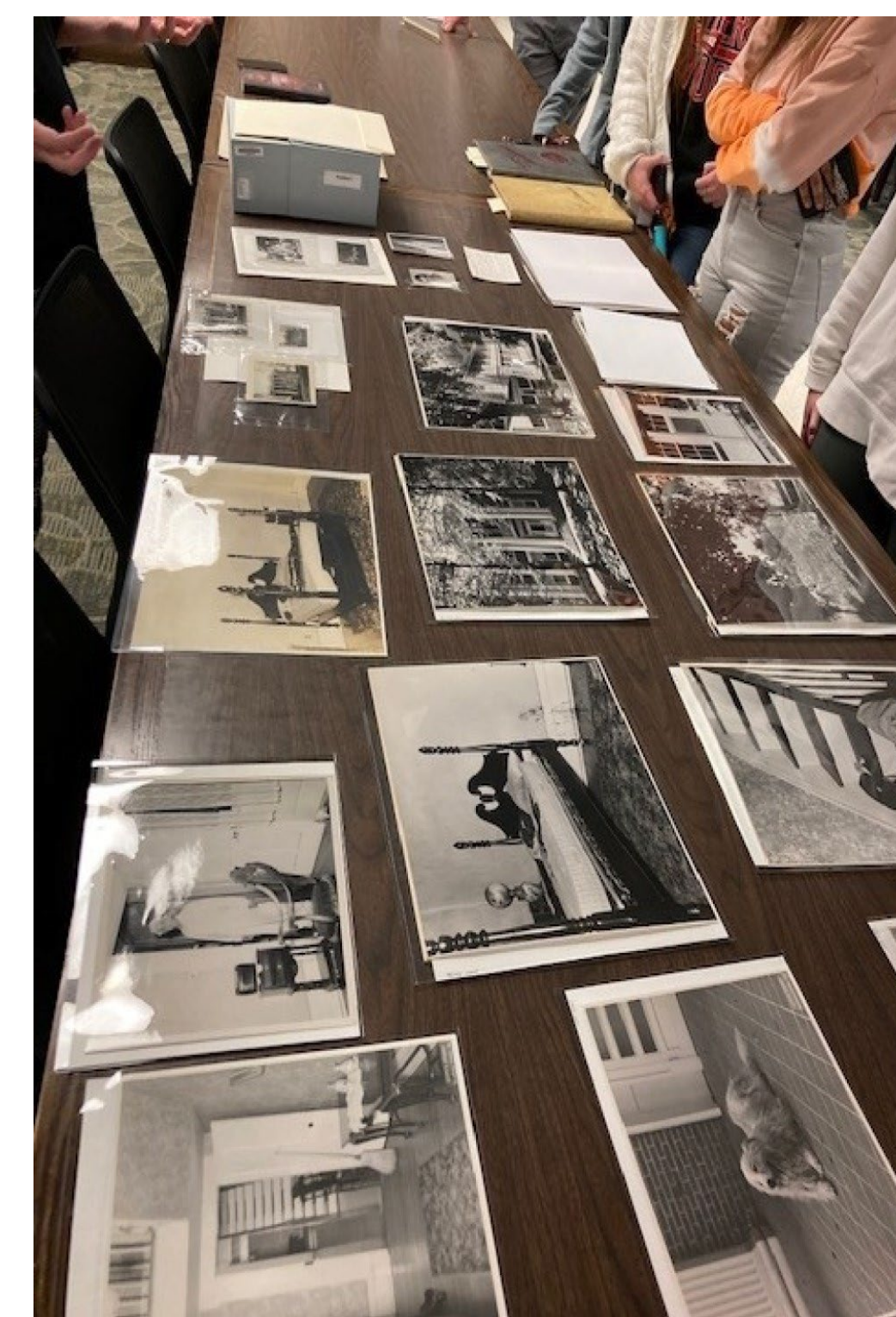
Photo Caption: Archival materials used during the Special Collections information literacy class.

A total of 13 students were enrolled in the Fall 2023 Criminology 101 course, Introduction to Criminal Justice, and were the subjects of this case study. These students were also enrolled in the Criminology Living Learning Community and would complete CRIM 101 in the Fall 2023 semester and CRIM 234, Crime and Popular Culture, in the Spring 2024 semester. As a primary research method, surveys were designed to collect data directly from the subjects. The pre- and post-surveys measured students' knowledge before and after the information literacy classes. Questions were designed to reveal students' confidence, comfort, and awareness levels related to services offered through University Libraries.